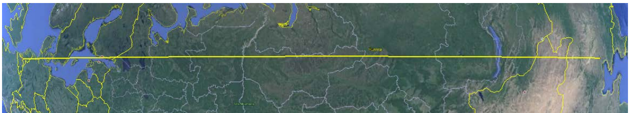
Figure 2: Great Circle between Europe and Northeast Asian Major Populations Centres