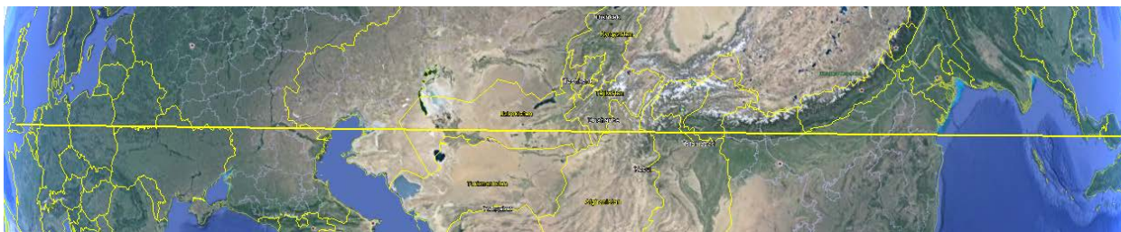
Figure 4: Great Circle* between Europe and Southeast Asian Major Populations Centres

*Note: the great circle is subject to a present-day conflict zone