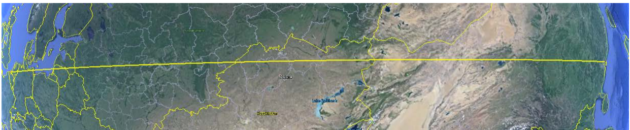
Figure 3: Great Circle between Europe and East Asian Major Populations Centres