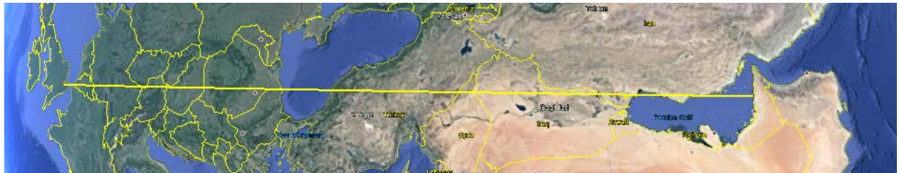
Figure 6: Great Circle between Europe and Gulf States