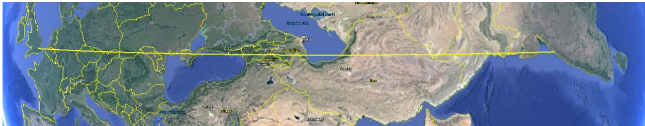
Figure 5: Great Circle between Europe and South Asian Major Populations Centres